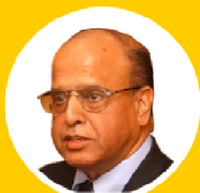
Padma Vibhushan Dr. K. Kasturirangan Chairman, National Education Policy -2020

National Education Policy (2020) - The Broad Contours